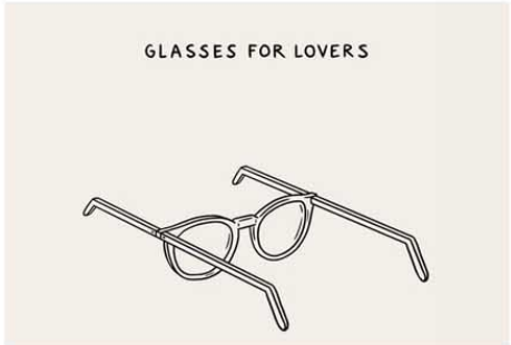
Matt Blease, 2015