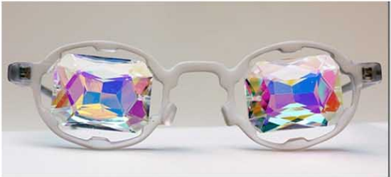
Pamelia Tietze, 2013- HOLES