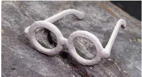
Sam Moore, 2015 - Glasses & granit