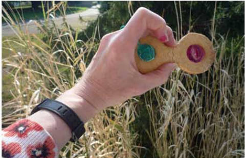
Sam Moore, 2016 - Lunettes de romans vs 3D