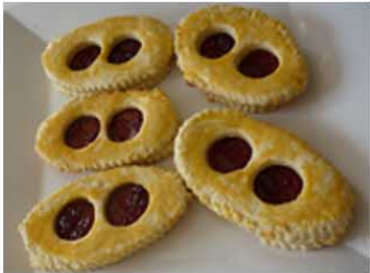
Lunettes de romans