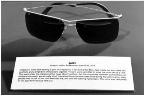
Chris Burden, 1972 - Jaizu