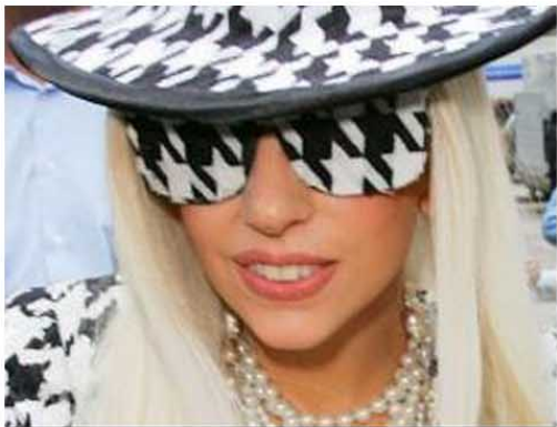
Ferragamo, 2011 pour Lady Gaga