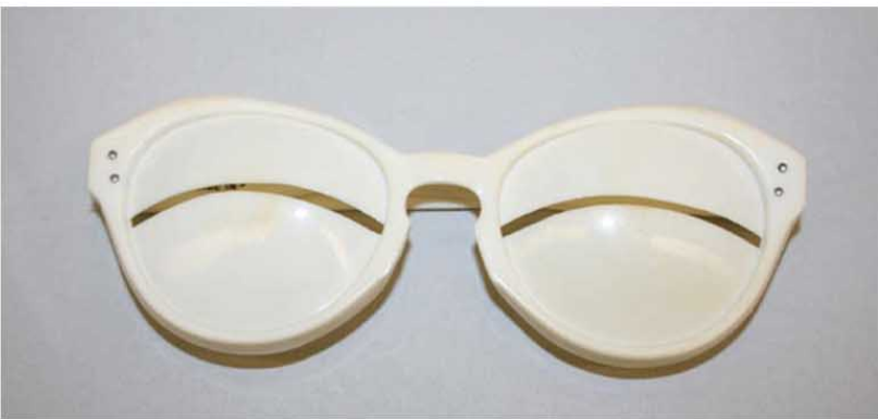
André Courrèges, 1965 - White goggles.